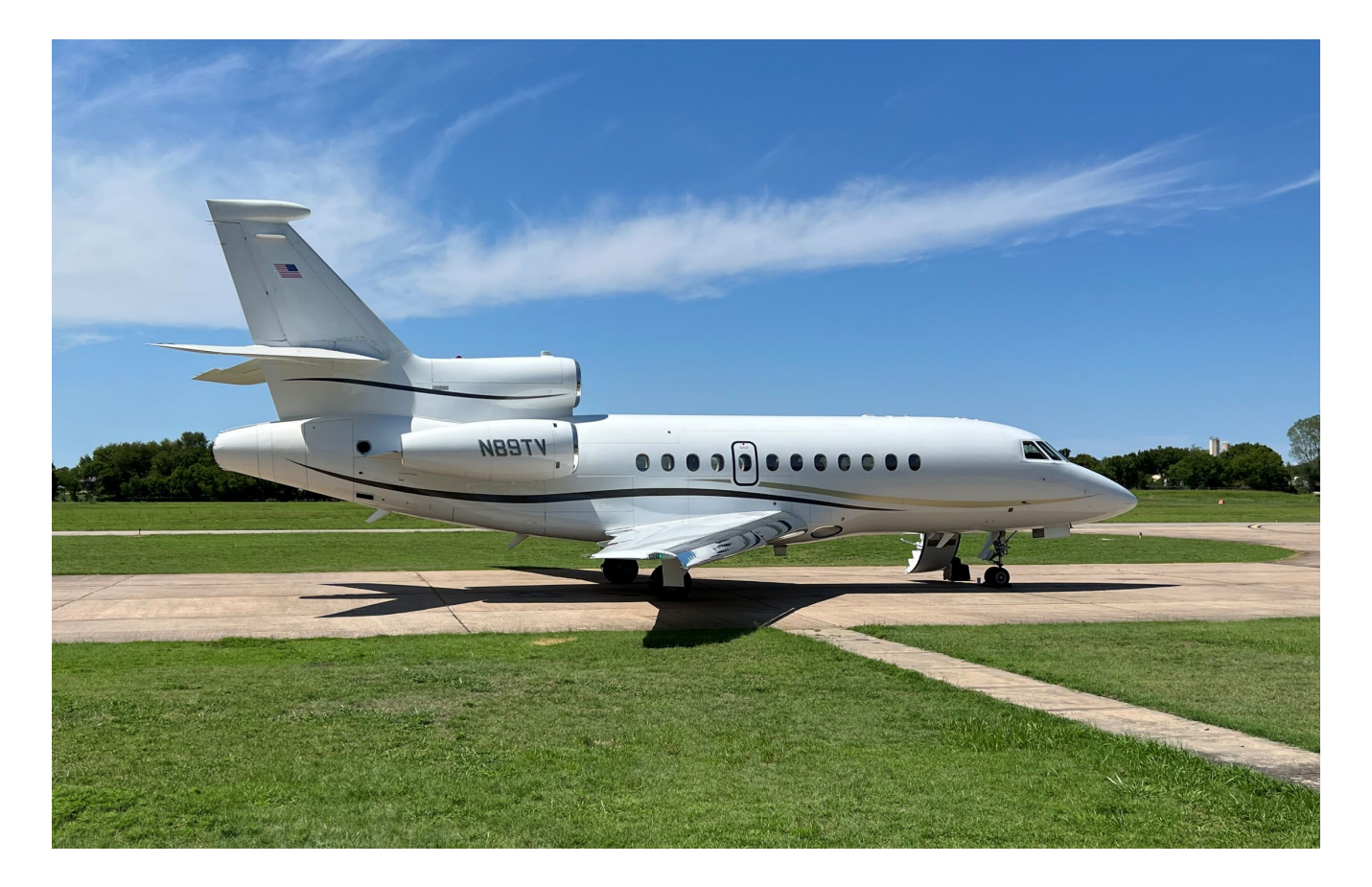
All New Paint Touch-up and Full Detail and Permaguard Treatment. Excellent Condition.